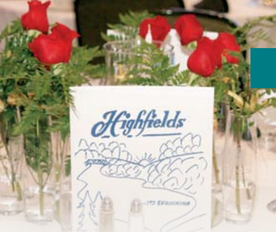
Table display at 50 th Gala.

More than 500 people celebrated Highfields' 50 th Anniversary.