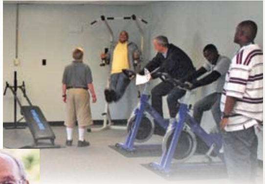
Check out the new wellness room at Highfields.