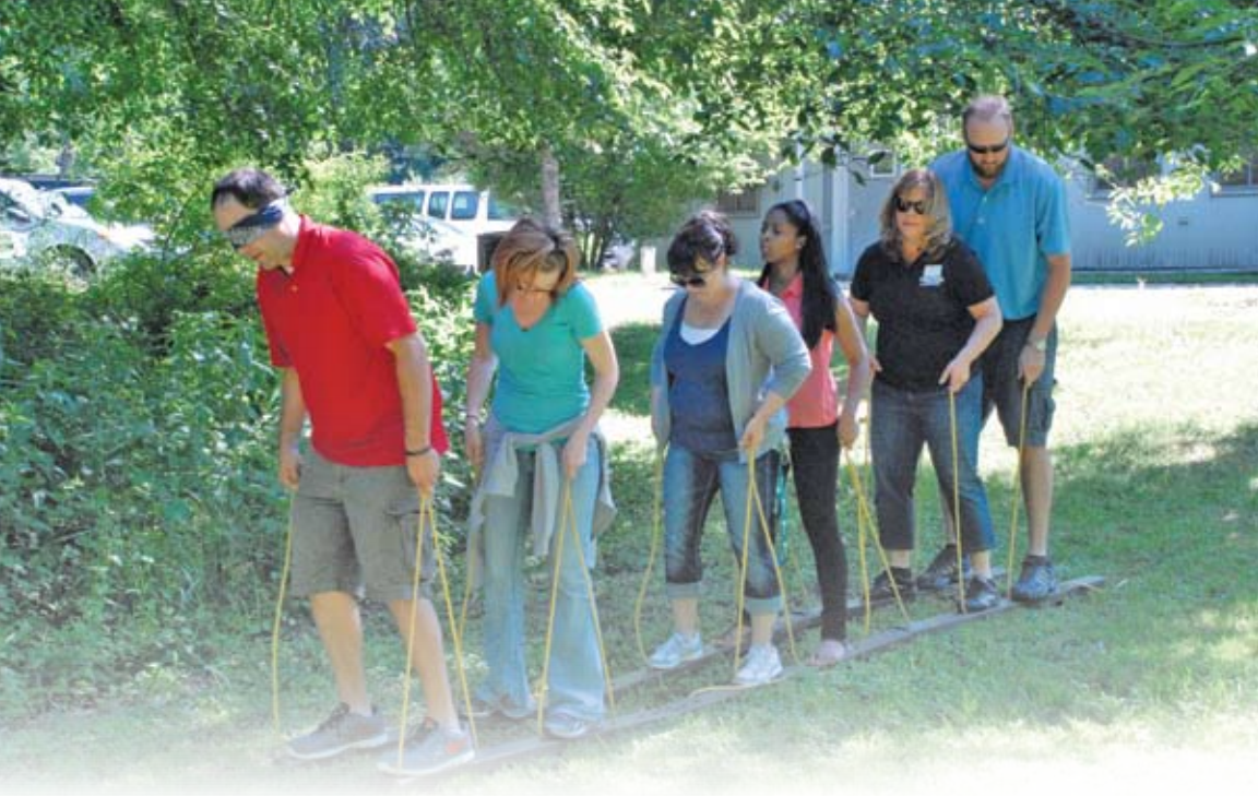
Staff in team training at Highfields' Breakthrough Experiential Education program.