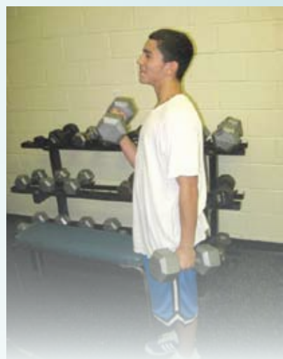
Residential students work out mentally and physically.