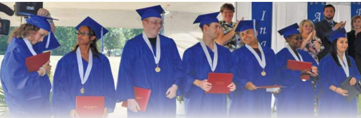
2012 graduates of Ingham Academy.