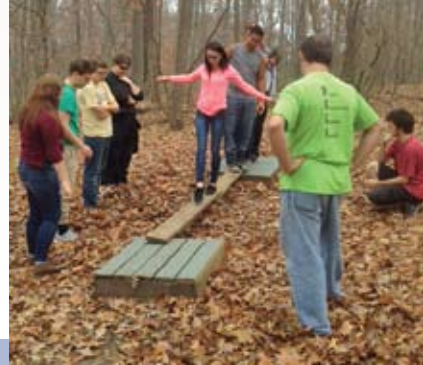
Students from Western High School take on Highfields’ Breakthrough course.