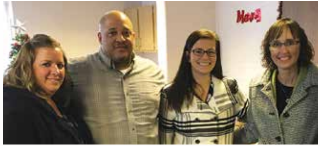
Maner Costerisan helped make the holidays brighter by donating gifts for residential students to take to their families.