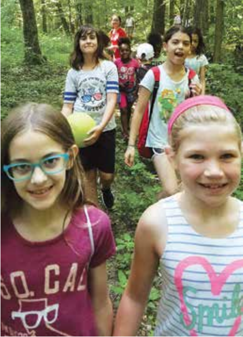
Hunt Elementary Reaching Higher students took on the Highfields Breakthrough course.